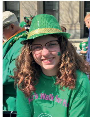
Kiera Brothers Pop and I are so proud of you and all of your accomplishments. We love you always!!!