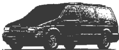
Plymouth Grand Voyager SE

Come in and see how our family works for you and your family!